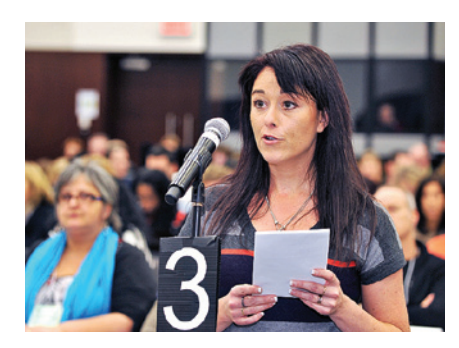
CSSS de Récancour-Nicolet-Yamaska

Nurses make up the largest group of healthcare providers in Québec. The issue of initial training, its conclusion and its possible repercussions are of major importance not only for the nurses, but also for all the healthcare professionals and the population that