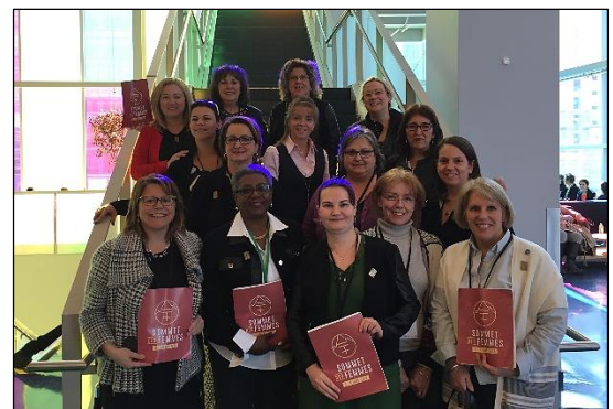
Several representatives and activists from the Federation attended the Sommet des Femmes , at the Montréal Convention Centre on March 3 and 4 last.